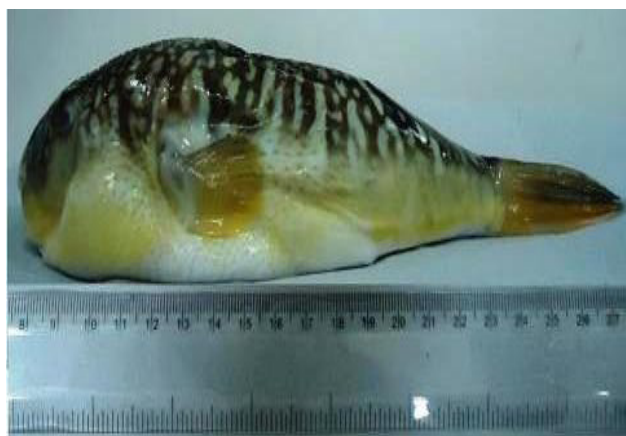
Figure 1: A specimen of Takifugu oblongus from Kasimedu Har-

As a result of mouse bioassay, the toxicity of the cellular fractions of the pufferfish Takifugu oblongus was determined. Cytosolic fraction showed maximum toxicity followed by death of mice within 5 minutes, while other fractions showed least toxicities followed by death after 35 min. Hence the other fractions could not be considered for calculation of toxicity in mouse units (MU) and presence of TTX. Cytosol fraction from ovary samples showed maximum toxicity with 228.31 MU/g, followed