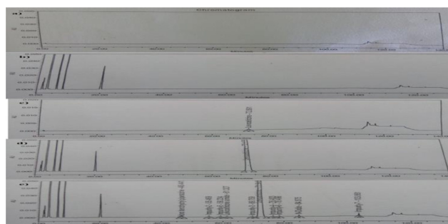
Figure 1: Chromatogram of a) Blank, b) Placebo, c) Standard, d) Unspiked sample, e) Spiked sample.

The aim of the present study is to develop a reversed-phase high-performance liquid chromatography procedure for the determination of LCZ in the oral solution dosage forms. LCZ is relatively non-polar compound as indicated by partition coefficient ( \log p = 4.94