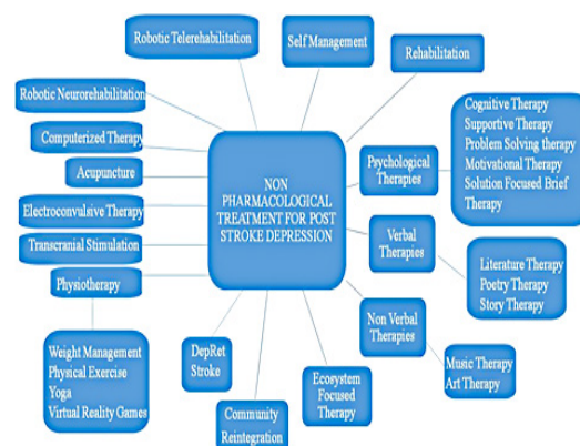
Figure 1: Non pharmacological treatment options to treat PSD.

d) Motivational therapy: Motivational therapy motivates the patient to ameliorate medication adherence and follow their lifestyle modifications and thereby creates awareness among the subjects regarding the consequences and hazards as a result of their behaviour